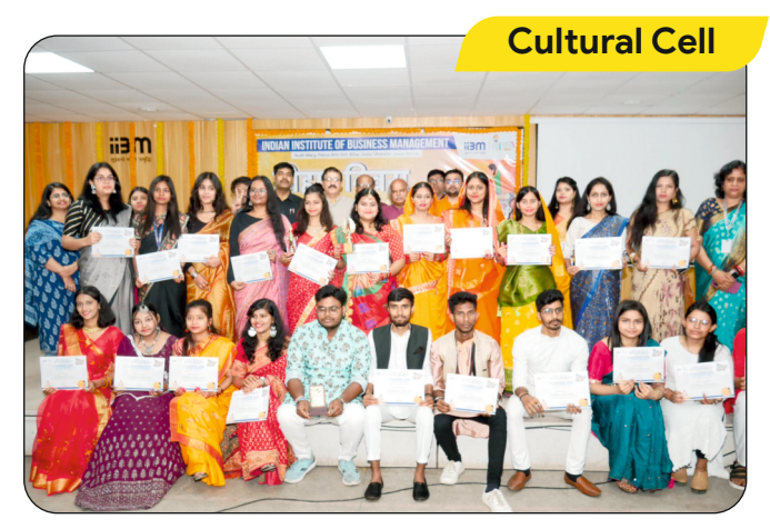
22-Mar-24: Bihar Diwas Celebrations at IIBM