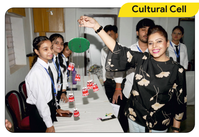
25-Jan-24: An In-house Exhibition Trash to Treasure