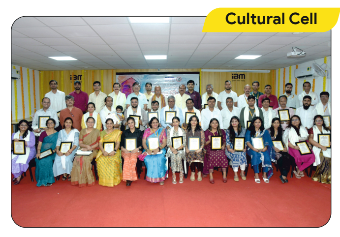
4-Sep-24: Guru Shiksha Samman 2024