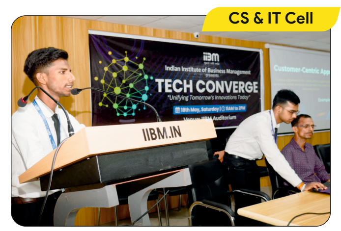
18-May-24: Tech Converge at IIBM