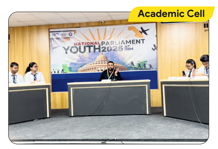
19-Mar-25: National Youth Parliament 2025 Debate held in IIBM Campus