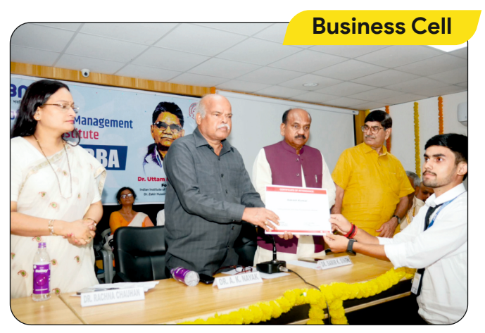
1-Aug-24 Induction Program for MBA, BBA and BCA