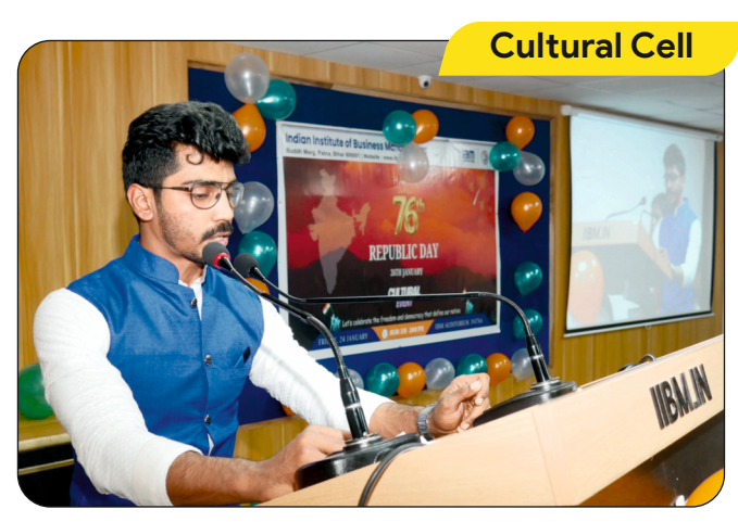
26-Jan-25: Republic Day Celebrations at IIBM