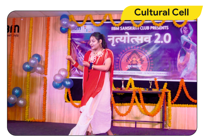
3-Oct-24: Nrityotasava 2.0