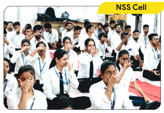
21-Jun-24: International Yoga Day Celebrations