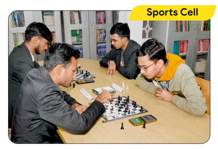
3-Feb-24: Chess Competition