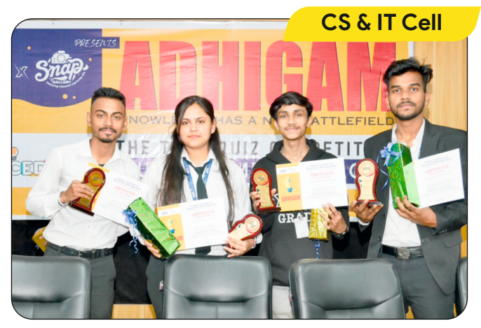
24-Feb-24: Adhigham Tech Quiz