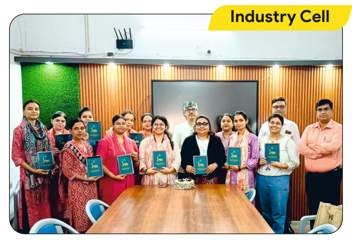
10-Mar-25: All Women Faculty and Staff Awarded Garima Award by Ujjivan Small Finance Bank