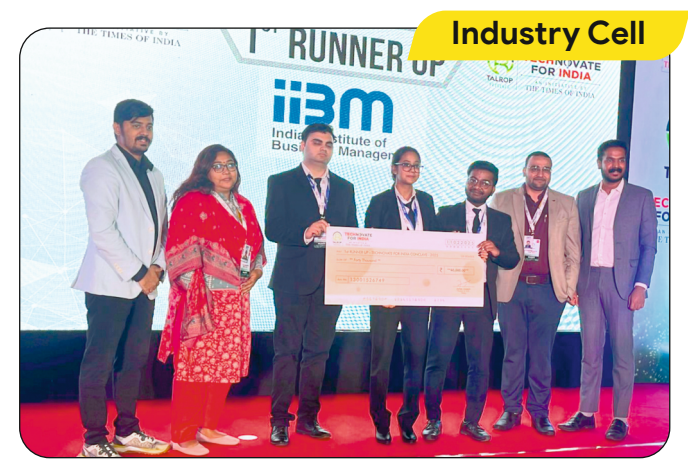
11-Feb-25: IIBM BBA Receive 1 Runner Up Prize in Startup Ideathon organised by Technovate & Tol